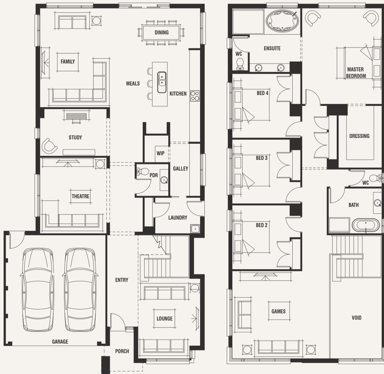
Standard floorplan with Retro façade